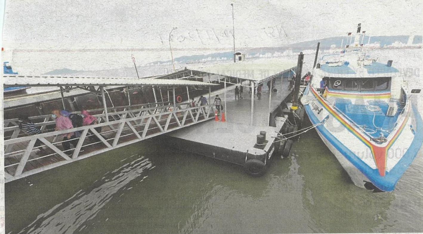
A fast passenger ferry docked at Pangkalan Sultan Abdul Halim in Butterworth, Penang on Jan 1.