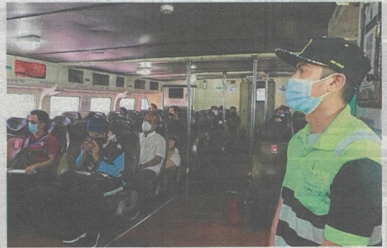
(Above) Commuters sitting comfortably in the air-conditioned fast-boat ferry at SPCT in George Town, Penang. (Left) Passengers disembarking at the terminal.