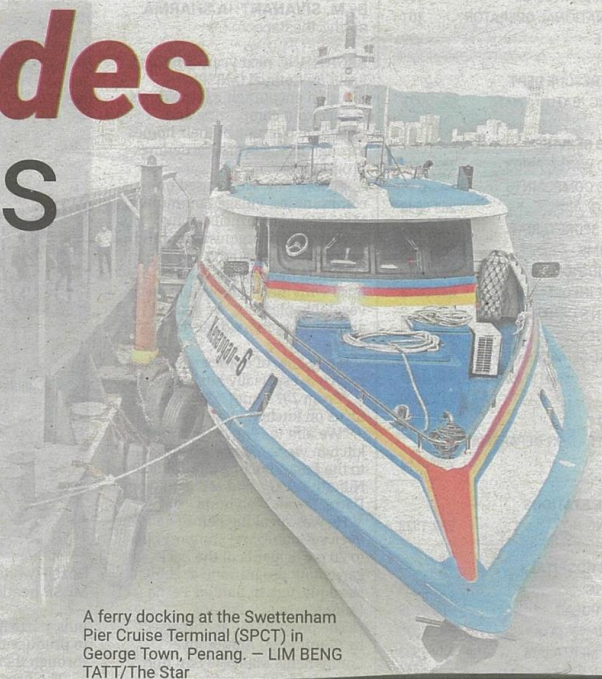
A ferry docking at the Swettenham Pier Cruise Terminal (SPCT) in George Town, Penang.